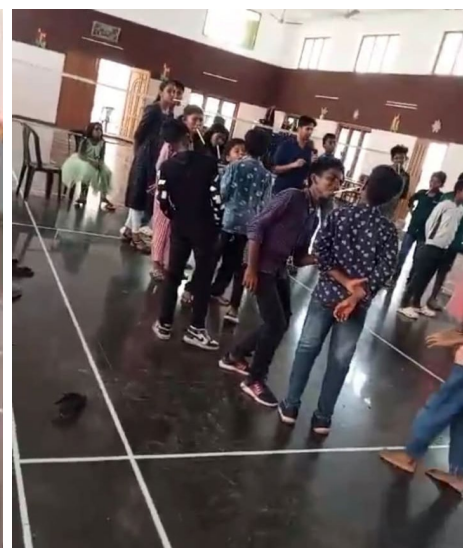
Straw and rubber band