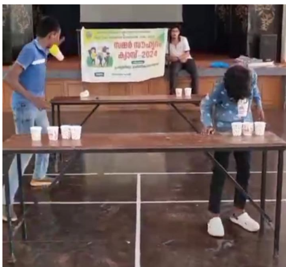
Paper glass passing

After the tea break, the presentation of the chart paper where conducted group wise. Then an activity of preparing the camp paper and its presentation was done group-wise. Following the exercise, the camp broke up for a 45-minute lunch break.