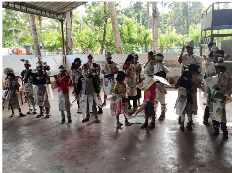
Newspaper Fashion show