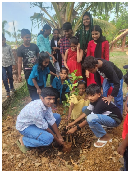
Planting a Sapling