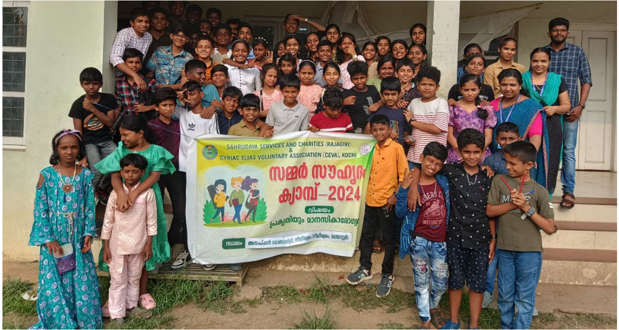
Campers, Scholastics from SH Province and Rajagiri Sahrudaya coordinating team

Following the lunch break, campers were energized by the Vibrant activities led by scholastics from SH province. Rajagiri Sahrudaya coordinating team collected the feedback of three day camp from the campers after the activities. Towards the end, prizes were distributed for each group who performed very well during the camp days. The camp ended with the group photo at 4:30 pm.