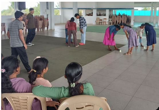
Paper Glass Game