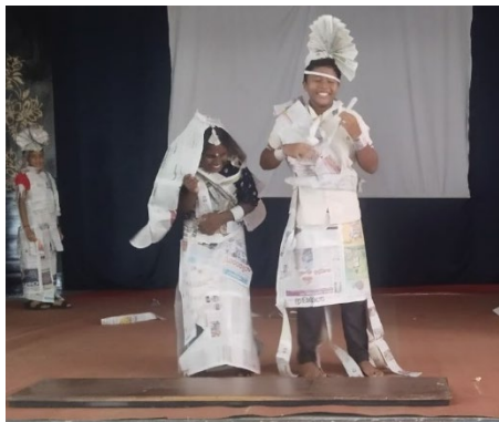
Newspaper Fashion Show

Scholastics from SH province take over camp leadership for the activities following the tea break. GroupWise newspaper fashion show competition was conducted as a task for each group. Following the exercise, the camp broke up for a 45-minute lunch break.